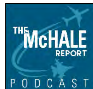
A McHale Report podcast about SOSA