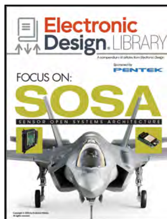
SOSA articles from Electronic Design Magazine