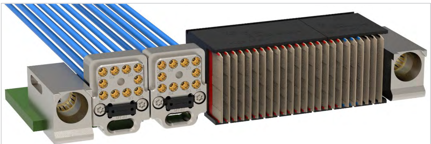
Figure 2. Rear view of 3U OpenVPX Module with two VITA 67.3D backplane connectors, each with 10 coaxial RF signals and 24 optical lanes.

Backplane I/O for RF signals and optical interfaces in OpenVPX have gained significant traction in CMOSS, MORAs, and HOST systems over the last six years, all enabled by VITA 66 and VITA 67 specifications. Eliminating front panel cable harnesses wins high