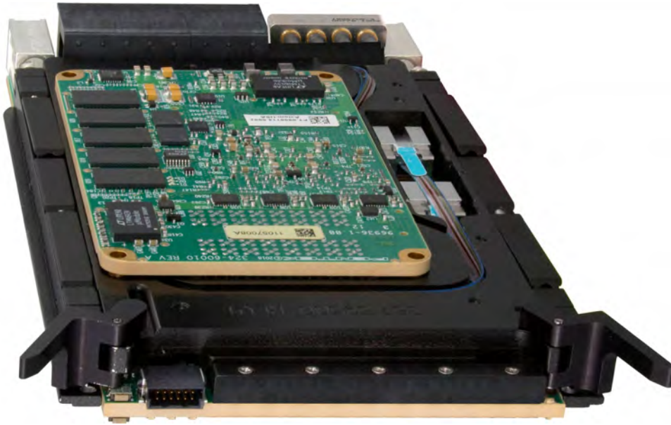
Figure 3. Pentek Quartz ® Model 5550 3U VPX 8 Channel A/D and D/A RFSoc SOSA-Aligned Processor incorporates RF and optical backplane using VITA 66 or VITA 67 connectors. The top cover has been removed to show details.

scores for maintenance and reliability. Some of the latest modular backplane standards offer extremely high density and even mixed RF/optical interfaces as shown in Figure 2.