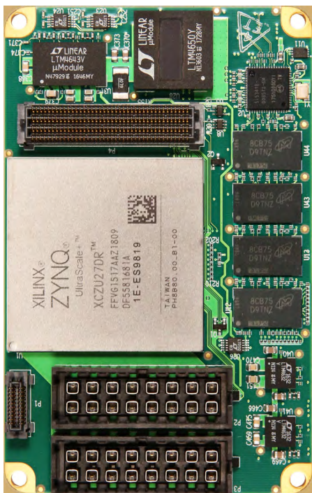
Model 6001: 8-Channel A/D & D/A Zynq UltraScale+ RFSoc Processor QuartzXM eXpress Module