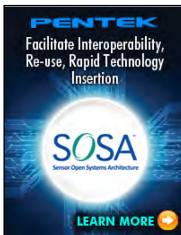
Pentek's SOSA web pages

For more information about SOSA, click on the resources below.